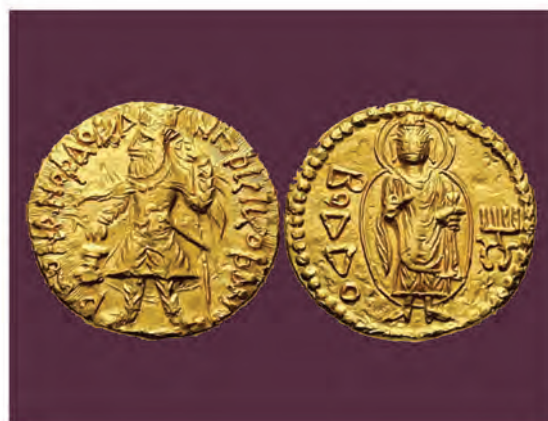
A gold coin of Kanishka – both sides

The well-known poet Ashvaghosh lived during the reign of Kanishka. He wrote the texts 'Buddhacharita' and 'Vajrasuchi'. The famous vaidya Charaka was also in Kanishka's court.