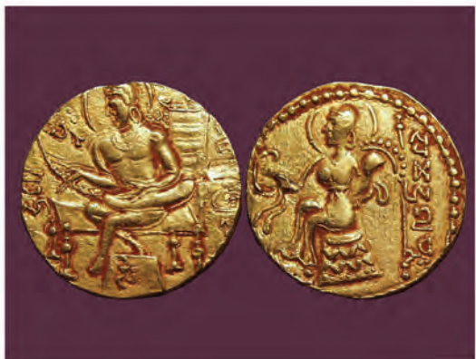
A gold coin of Samudragupta – both sides

Samudragupta : The expansion of the Gupta empire began during the reign of Chandragupta I. His son, Samudragupta, defeated the smaller neighbouring kingdoms and extended the empire further. In his time, the Gupta empire spread from Assam upto the Punjab. He had also conquered the eastern coastal region up to Kanchi in Tamilnadu. Due to these victories, his power came to be recognised everywhere. As a result, kings on the northwestern frontiers as well as those in Sri Lanka made treaties of friendship with him. A pillar inscription at Prayag describes Samudragupta’s conquests and victories. This inscription is known as ‘Prayag-prashasti’ and also as ‘Allahabad Prashasti’. He was an expert veena player. He minted coins which had a variety of images engraved on them. In one of them, he is seen playing the veena . His name Samudragupta, is engraved on it.