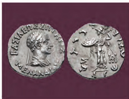
A silver coin of Menander – both sides

During this period, there were several small kingdoms ruled by Greek kings to the northwest of the Indian subcontinent. Those kings are known as Indo-Greek kings. In the history of the coins of ancient India, the coins of these kings are very important. They had a tradition of putting the picture of the king on one side and that of a deity on the other side. This tradition later took root in India. One of the famous Indo-Greek kings was Menander, who discussed Buddhist philosophy with the Buddhist bhikkhu , Nagasena. Menander is also referred to as 'Milinda'. The questions that he discussed with Bhikkhu Nagasena led to the creation of the book 'Milind Panha'. The Pali word ' panha ' means 'question'.